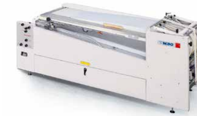
DUALFEED continuous feeder

Special equipment: FP palletised feeder, NAVIGATOR control with touchscreen, long conveyor table with ejection device and alternating deflector, slitter shaft cassette MWK for folding unit II, noise insulation device and delivery ASP 66.