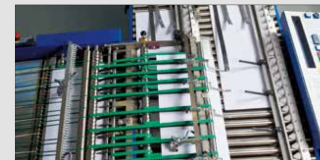
Production with alternating deflector