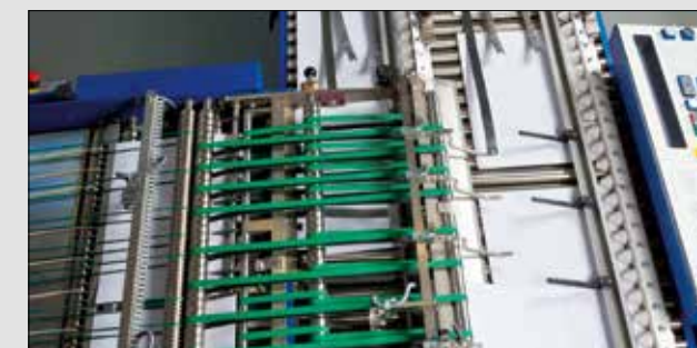
Double stream production

With the specialized MBO transfer table it's easy to setup traditional double stream production; no time consuming add-on installations would be required. For standard production with only one sidelay in folding unit II the alternating deflector is easily deactivated with a switch.