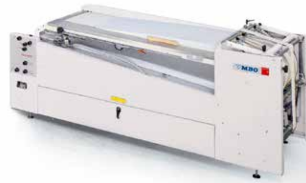
DUALFEED continuous feeder

Special equipment: FP palletised feeder, NAVIGATOR control with touchscreen, long conveyor table with ejection device and alternating deflector, slitter shaft cassette MWK for folding unit II, noise insulation device and delivery ASP 66.