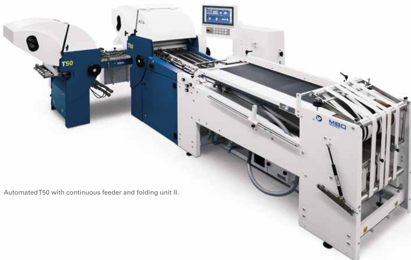
Automated T50 with continuous feeder and folding unit II.

brothers" are also available as options. With a Vivas vacuum system, slitter shaft cassette and comprehensive automation options, it can be optimally tailored to any job requirements. It features a valuable equipment level as standard, including an intuitive operation touchscreen and marking-free sheet alignment via high-speed guides in the second folding unit.