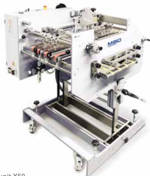
X-folding unit X50

The X50 mobile X-folding unit expands the folding type range of the T50 and allows additional crossfolds and special folding types to be produced. The knife is pneumatically driven and features particularly low wear-off. The X-folding unit is height adjustable and can therefore be used as a second or third folding unit. Rear slitter shafts incorporated as standard are positioned parallel to the folding knife and open up further application options. Gatefold brushes available as optional equipment can be used to produce closed gatefolds. To achieve this, the X-folding unit is used as a third folding unit.